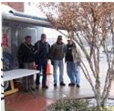
Club members brave the snow and cold temperatures at the Westview Promenade cruise-in.