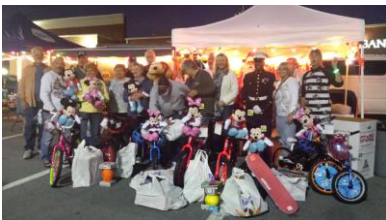
The Heart of Maryland Classic Chevy Club with bicycles for Toys for Tots.

Thanks to all that helped make sure some less fortunate children in our community had a very Merry Christmas.